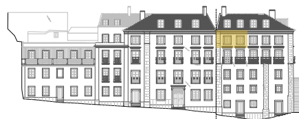
ALÇADO PÁTIO DO SALEMA | PÁTIO DO SALEMA FACADE