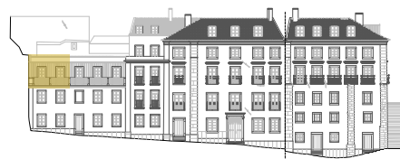
ALÇADO PÁTIO DO SALEMA | PÁTIO DO SALEMA FACADE